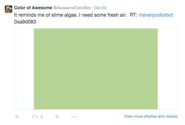
Figure 3. A tweet with a colour, a name, and an attitude.

@AwesomeColorBot also tailors its tweets to suit the category of a name, to produce outputs like that of Fig. 3.