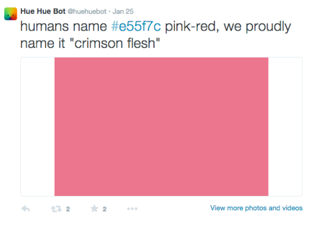
Figure 1. A tweet with both RGB hexcode and apt name.

A Twitterbot named @ HueHueBot has been constructed (by the second author) to showcase the perceptuallyanchored creativity of this readymade-based approach to colour-name invention. An example tweet of this bot, with attached colour sample, is shown in Fig. 1.